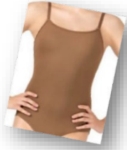
(camisole with attached bra)

To ensure that all female students have the proper inconspicuous support, we are recommending the following leotard purchase as well. The undergarments (bras and/or leotards) should be your skin tone. If any assistance is needed to purchase the proper tone, please inquire.